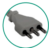
Type L - 16A