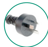
Type I - Australia