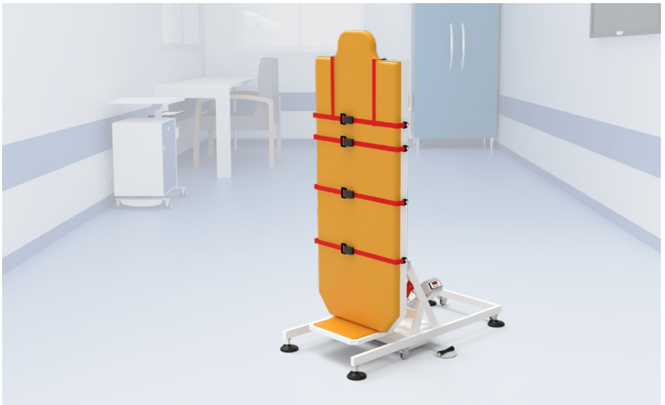
ORTHOSTATISM MAX 85°