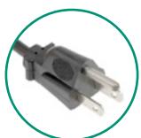
Type B - Canada and USA