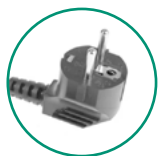
Type F - Schuko