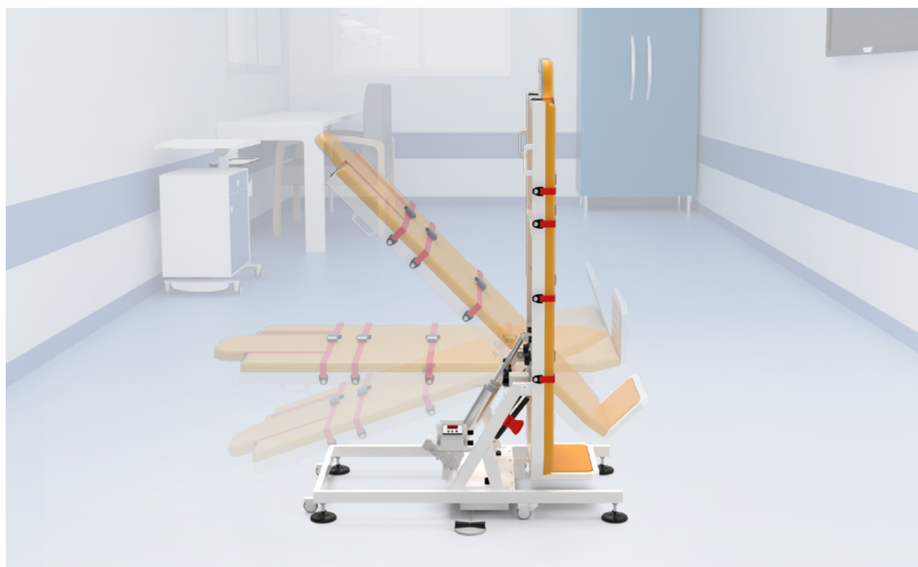
THE MOTORIZED DYNAMIC PLANE HAS A HIGH RANGE FROM +85° (ORTHOSTATISM) TO -20° (TRENDELENBURG)