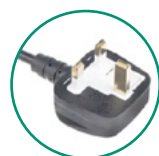
Type G - UK plug