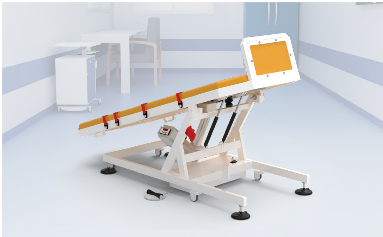
TRENDELENBURG - 20°